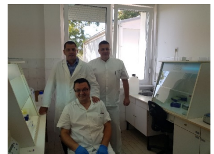
The team at VSI Kraljevo

VSI-Kraljevo has experienced research teams in laboratory diagnostic specialisms and veterinary epidemiologists involved mainly in applied research in the area of detection and control of contagious and vector borne animal diseases, including LSD and ASF.