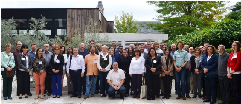
The Defend Consortium at the annual meeting in Mechelen, Belgium

The DEFEND consortium held its second annual meeting at the Hotel Elisabeth in Mechelen, Belgium, on 26-27 September 2019. The meeting brought together over 45 participants, from 24 partner organisations, travelling from across Europe and even as far as South Africa. The project was also delighted to welcome members of the Multi-Actor Panel (MAP), who provide advice on the dissemination, exploitation and impact of DEFEND outputs, and members of the Ethics Advisory Board (EAB), whose role is to provide advice on ethical issues within the project.