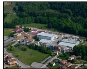
Zoetis Manufacturing & Research