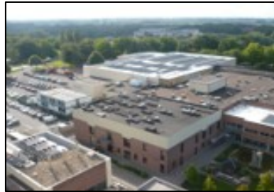
Zoetis Belgium S.L.